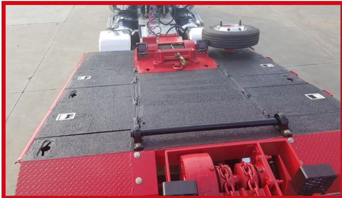
RECESSED TOOLBOXES AND OPTIONAL 30K CABLE WINCH