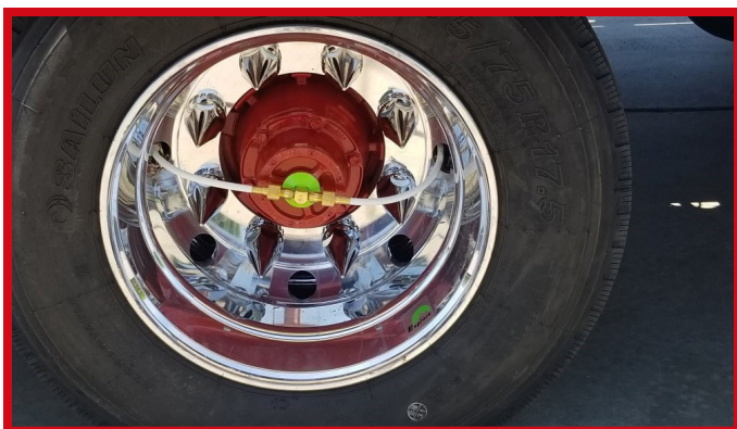
ALUMINUM WHEELS AND TIRE INFLATION SYSTEM