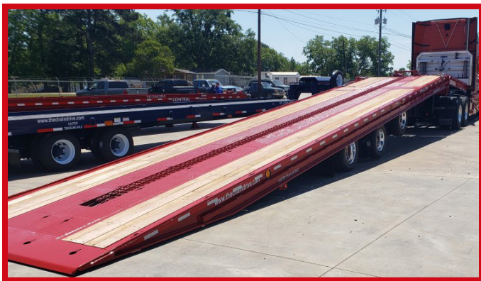
OPTIONAL WOOD DECKING - APITONG